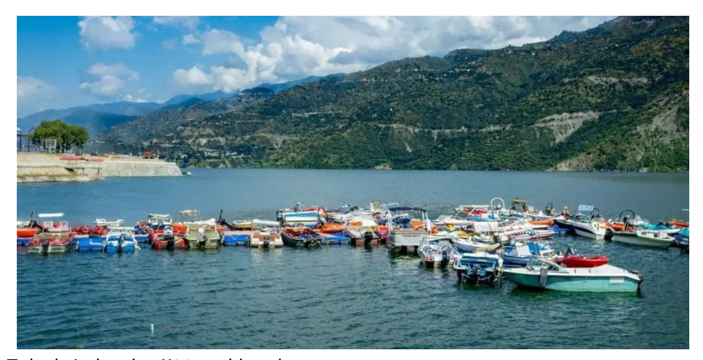
Tehri Lake in Uttarakhand

One of the highlights of the floating resort is the private deck that extends into the lake. You can relax on the deck, soak up the sun, or take a dip in the refreshing waters. The resort also offers various water activities such as kayaking, paddle boarding, and fishing, allowing you to make the most of your time on the lake.